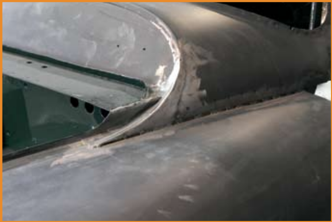
The photo at the left is of a spot on the XK cars that is particularly prone to revealing stress fractures as the years go by. Rather than just using some sort of “filler” the XK crew will weld in a reinforcing plate, then shape it to the correct contour.